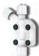
PP Self venting