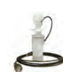
Level Probe with foot filter