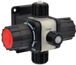
MF MULTIFUNCTION VALVE

Multifunction valve (pressure, safety, antisiphon and bleed) 1/2" connections for different hoses diameters. FKM B or EPDM o-ring. PVDF body.