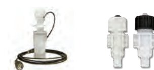
Level Probe with foot filter