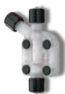
PVDF Self venting