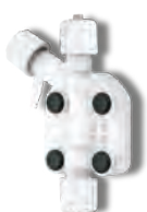
PP Manual venting