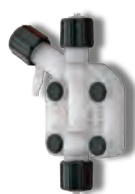
PVDF Manual venting