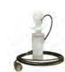
Level Probe with foot filter