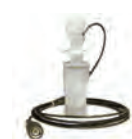
Level Probe with foot filter